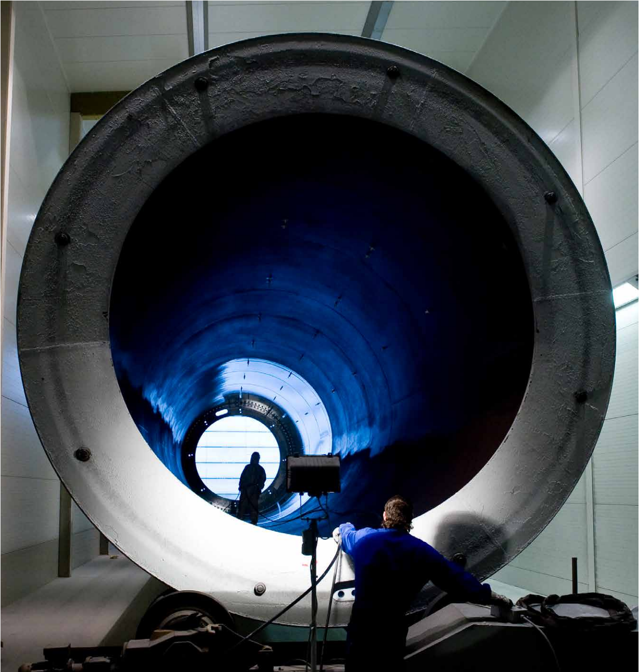
Coating work on a wind turbine tower