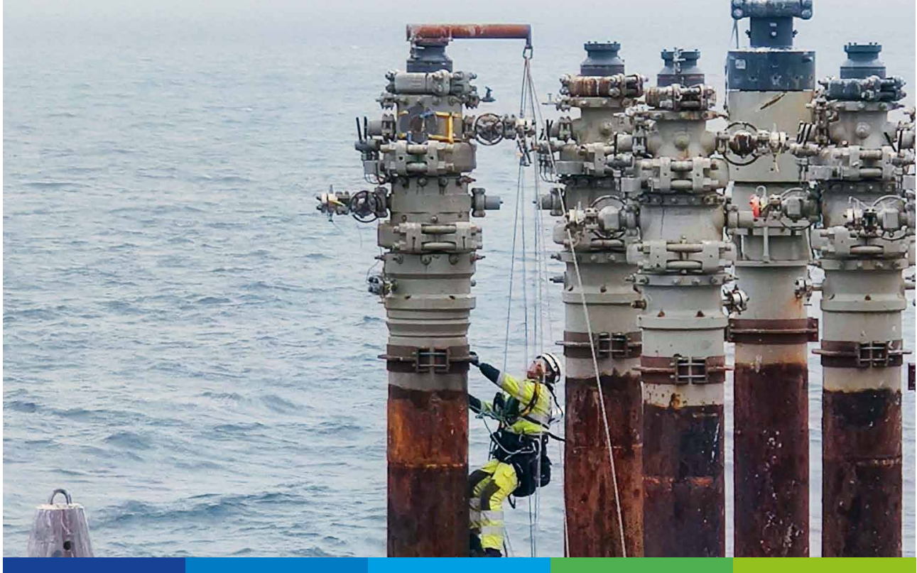
Offshore surface protection work