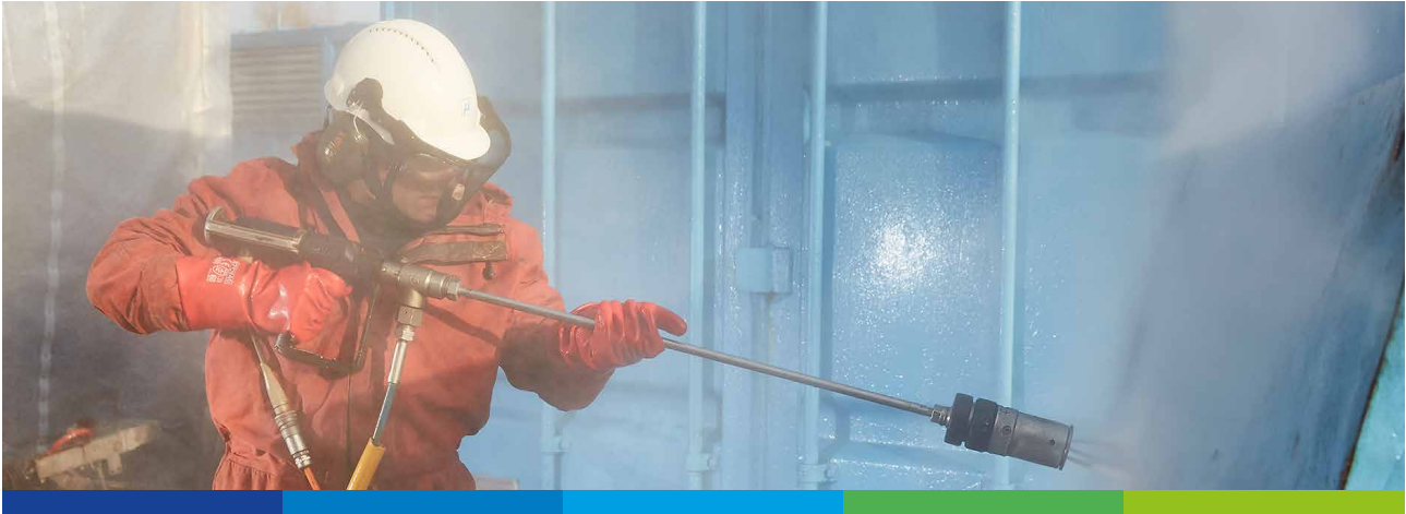
Blasting of a surface in preparation for the application of surface protection