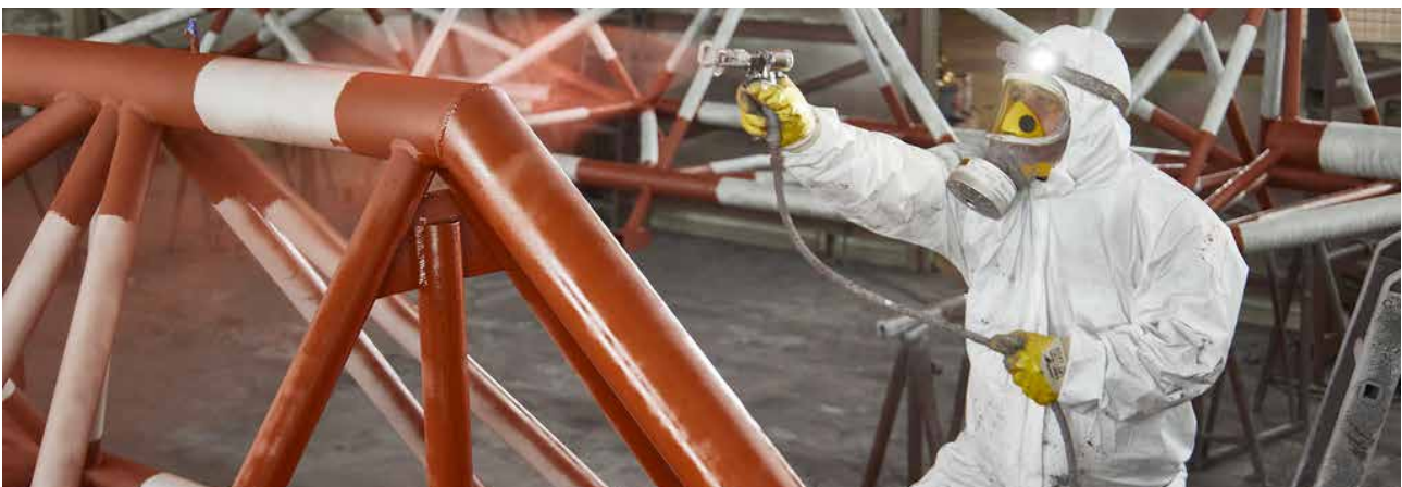
Application of surface protection

Setting aside the war in Ukraine and the consequences and economic risks triggered by this, there are no material changes to the Group's opportunities and risks in comparison with the 2021 financial year. We therefore refer you to the detailed notes published in the 2021 Annual Report.